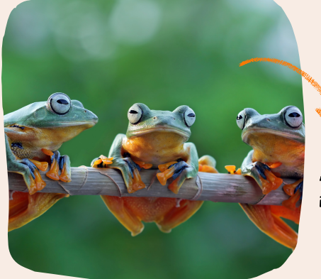
A group of frogs is called an army.

One of the surest signs of spring is frogs singing. Here 's some fun froggy facts for you: